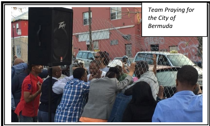
Team Praying for the City of Bermuda

On March 29-April 5th an evangelistic team of nine was blessed to minister in two (2) homes for troubled teens, two (2) senior citizens homes, at the local church, and the highlight of the weekend was an outdoor/outreach evangelistic meeting in the downtown area of Bermuda. There are many testimonies of salvation and deliverance. With prayers and financial support from several across region, this was a very fruitful evangelistic trip. Please continue to pray for our local church in Bermuda.