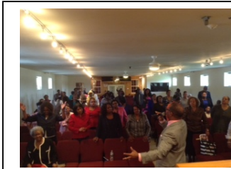
Regional Bishop brings the Word on Saturday morning!

The Capital & Hudson Valley – For the first time met at the Middletown Church for convention and from all reports it was outstanding and spirit-filled. They met under the theme “From Brokenness to Wholeness.” The fellowship was great, the preaching anointed, the worship uplifting and many left charged and invigorated. Thank God for His powerful presence felt and experienced.