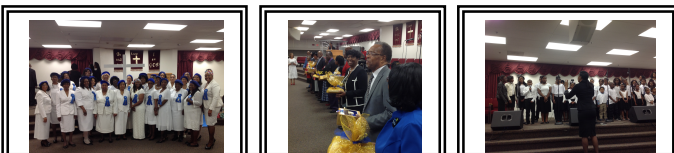
Ladies Ministry – Appreciation Time - and Children's Program